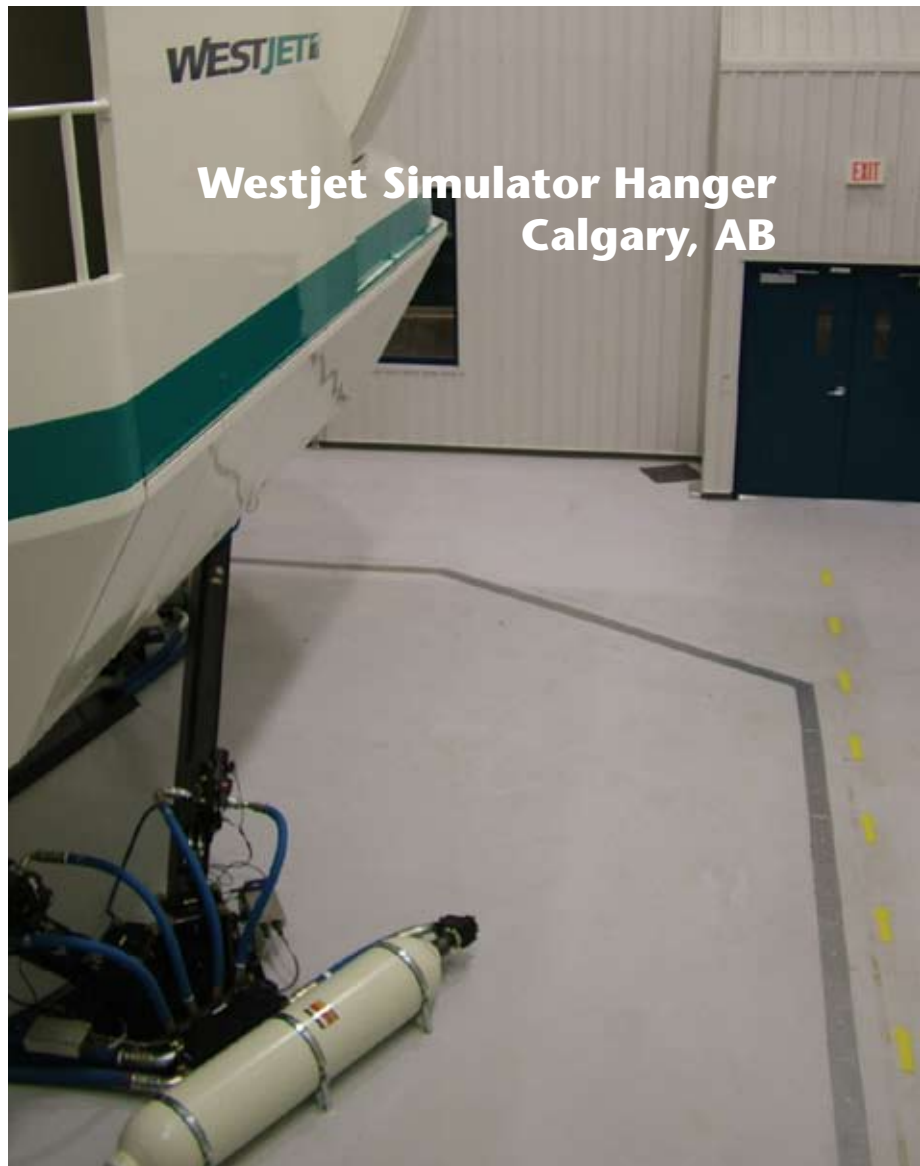
Westjet Simulator Hanger Calgary, AB